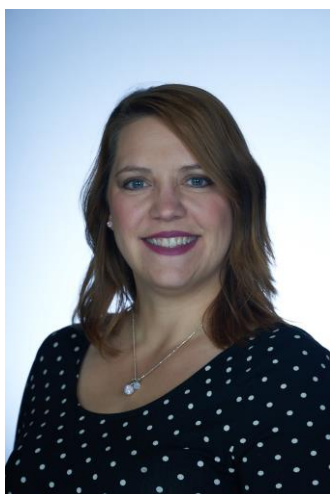
January 2019 Presidents Message

Happy New Year! I trust everyone's Holiday Season was a full of happiness, health and memories!